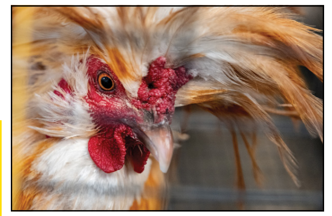
A rooster struts his stuff in the Livestock's chicken exhibit.