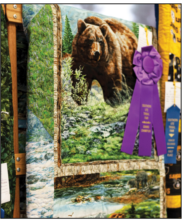
A stunning bear quilt was deemed Grand Champion.