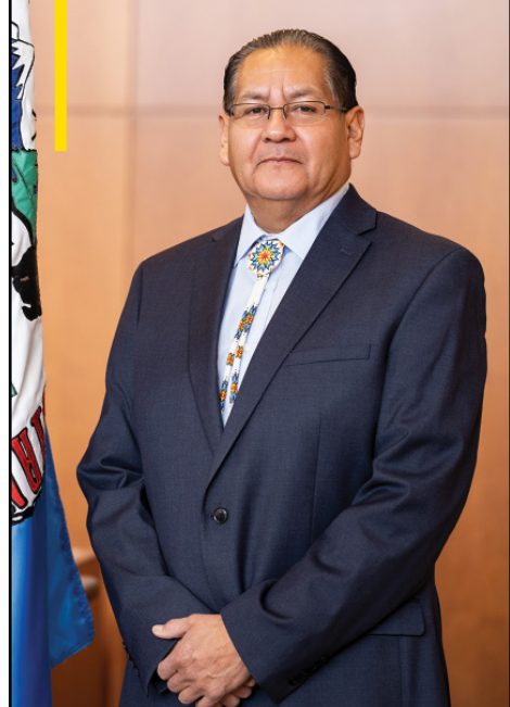
Welcome to the 101st Annual Southern Ute Tribal Fair!

Fairs are a time-honored tradition where people from all walks of life come together to celebrate their shared community. Here at the Southern Ute Tribal Fair, we are proud to offer something for everyone, from delicious food and exciting entertainment to fascinating cultural exhibits, dancing, and games.