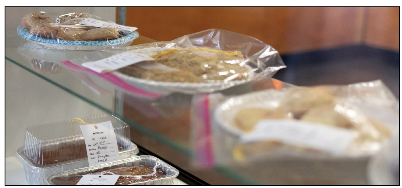
Krista Richards / SU Drum Exhibitors entered their baked goods in various categories, all vying for top prizes.